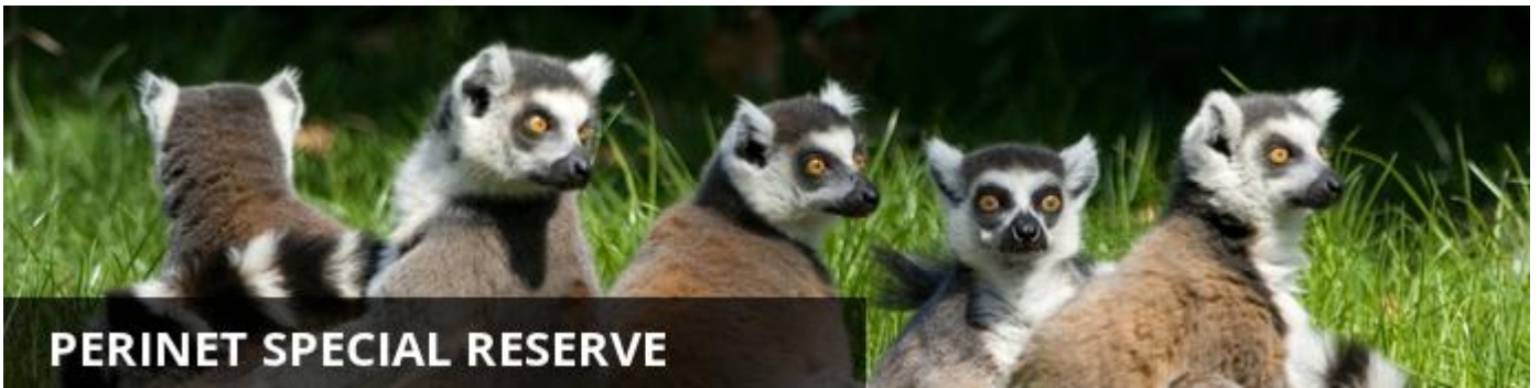
PERINET SPECIAL RESERVE